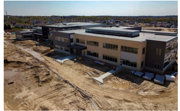
Sidewalks are being poured outside the doors to the building, and more sidewalk will be poured next week!