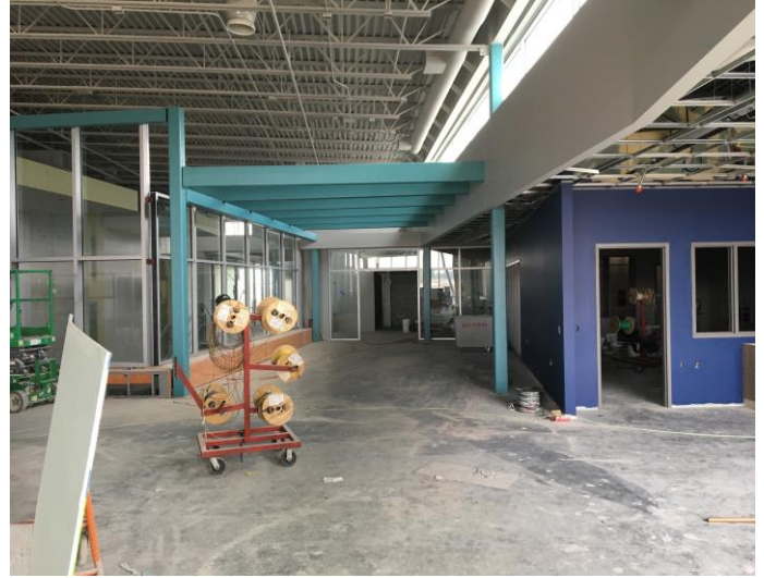
The art room and library are painted, and they have received most of the glass for their windows as well.