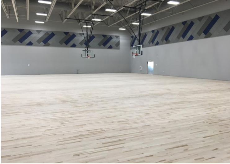
This week, the gym floor is being sanded and sealed, and then next week the game lines will be painted!