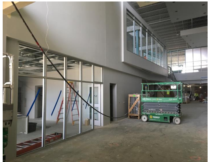
In the main entrance hallway, the frames and glass have been installed. The first floor windows look into the receptionist office, and the 2 nd floor windows are in the library and look down into the main hallway!