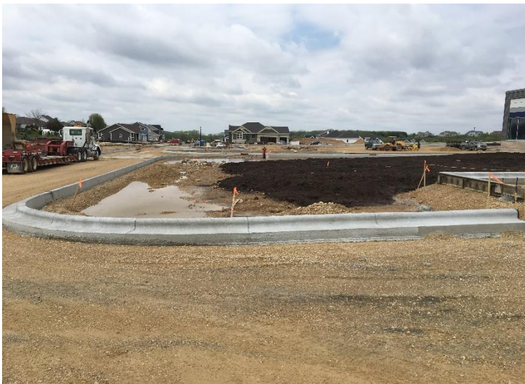
Curb and gutter was poured this week, outlining the parking lots and driveways so that the asphalt can be poured soon. The sitework is moving along quickly and looking great!