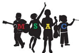
Monroe Street Arts Center

Monroe Street Arts Center (multit-age) http://monroestreetarts.org/