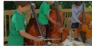
WISTA Camps June 25th - 27th and June 28th - June 30th, 2017 $289 - 3 Day All-Inclusive Camp Experience $275 Register by...

WISTA Camps - http://wiasta.org/wista-camps.html Orchestra completing grades 4-6