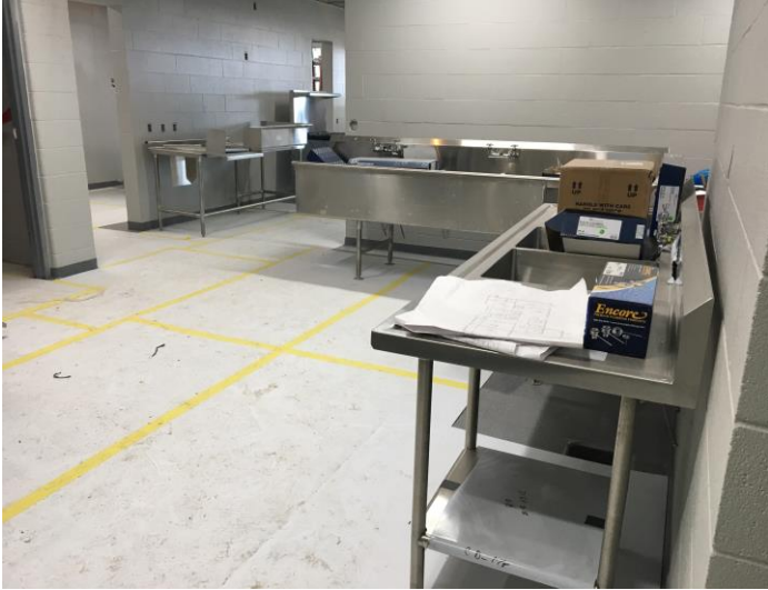
In the kitchen, sinks and other equipment have arrived and are in the process of being installed!