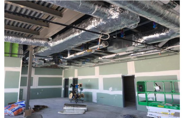
In the art room, as well as other rooms on the 2 nd floor, MEP rough-ins and insulation are finishing up to get ready for paint!