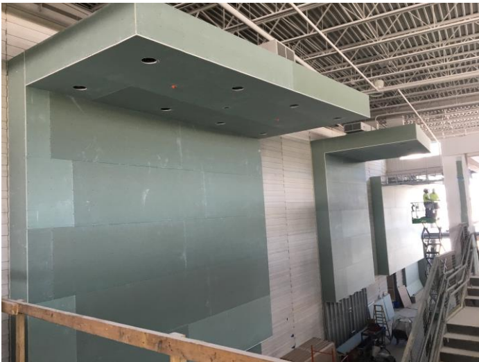
The overhanging clouds at the main entrance are drywalled. Once they are painted, they will be a great looking feature for students walking into school!