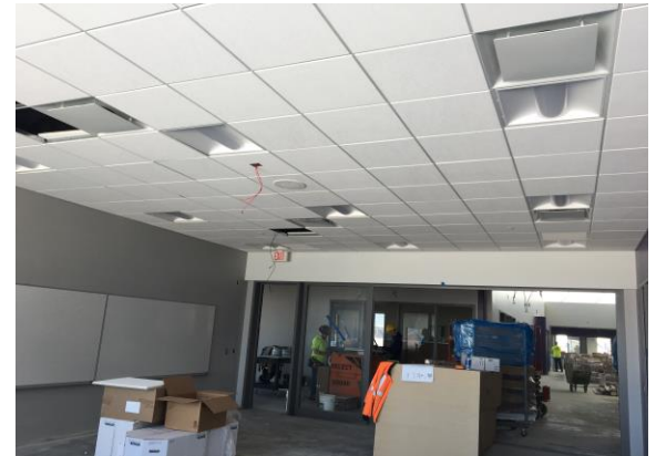
Ceiling tile was dropped in the kindergarten/1 st grade classrooms this week, and the other classroom wings will follow shortly!