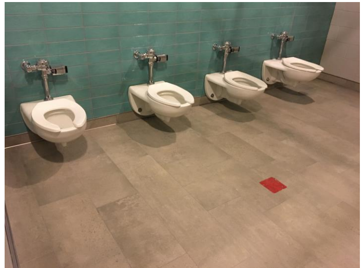
Floor tile, toilets, and sinks have been installed in the first floor bathrooms. The plumbers will move to the second floor in the next couple of weeks.