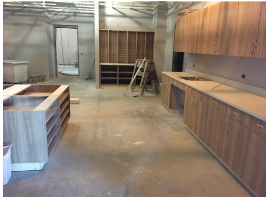
Casework installation in progress in the administrative offices.