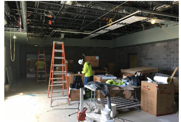
The music room shown here also functions as a tornado shelter during bad weather! The fun fact below talks more about this room and its safety measures.