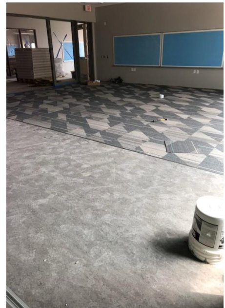
Carpet is installed in the classroom wing cubby areas, as well as in the kindergarten/1 st grade classrooms!