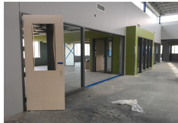
The classroom wings are getting the finishing touches. Here you can see the wood doors installed, and the sliding glass doors will follow.