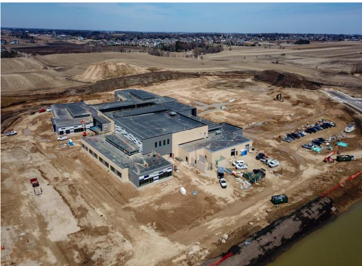
Sitework is continuing at the school, as site grading started this past week. The soccer field and baseball field were leveled off so that landscaping can begin, and the parking lot was leveled so that asphalt can be poured soon!