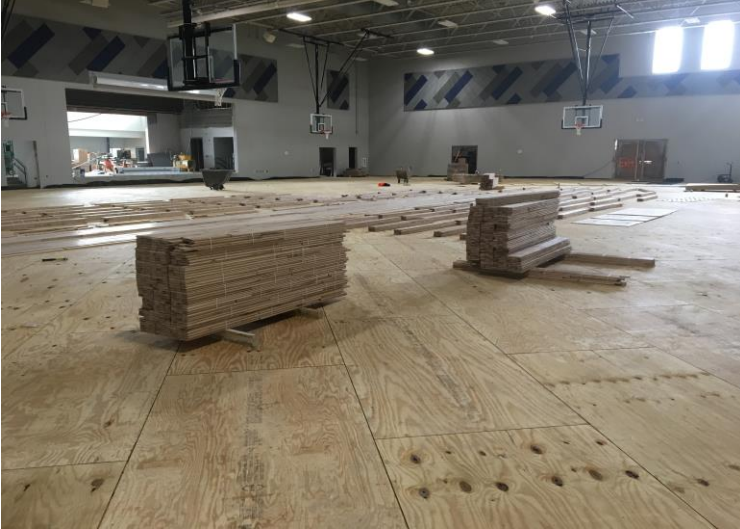
The wood floor installation started in the gym this week! First, the base layer is laid down, and then next week the top coat that is made of maple wood will be installed!