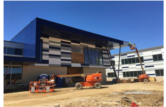
Metal panels have been installed on the exterior wall of the library.