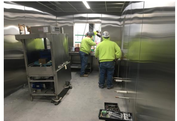
In the kitchen, stainless steel walls have been installed where the dishwasher is located. Here, two crew members are busy installing a sink in the dishwasher room!