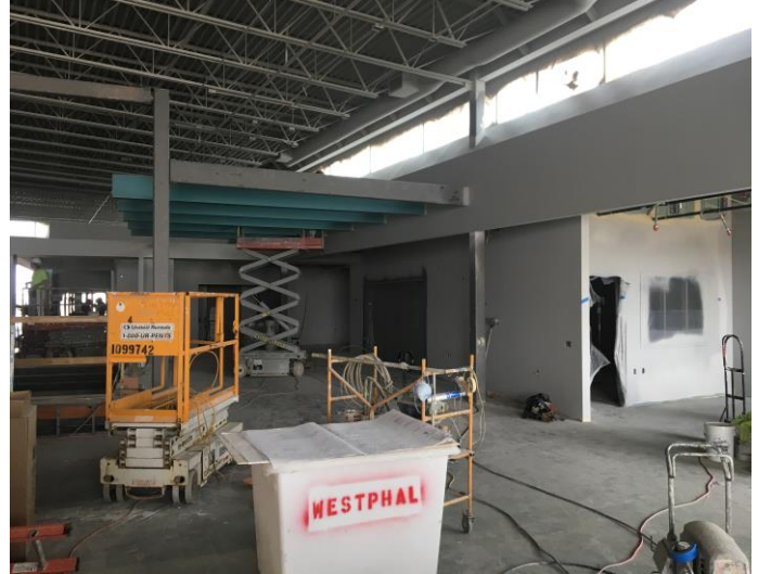
The art room and library are being painted. It's one of the last areas to receive paint before the entire building is painted!