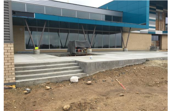
The patio by the cafeteria has been poured, and it will let kids enjoy lunch outside on nice days!