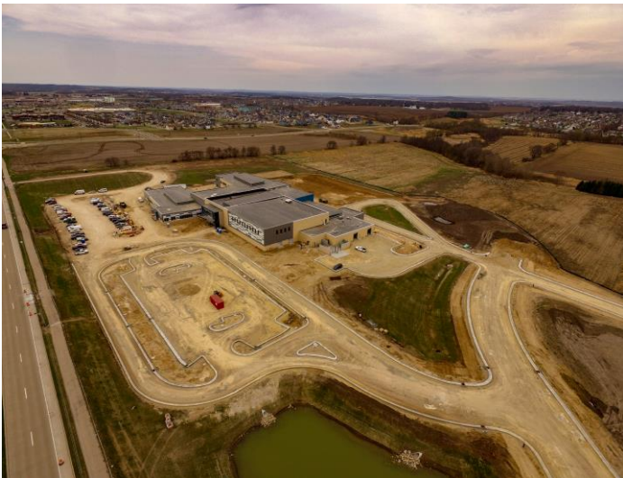
Site work is making great progress! This week, curb and gutter concrete was installed, paving the way for the asphalt to be poured.