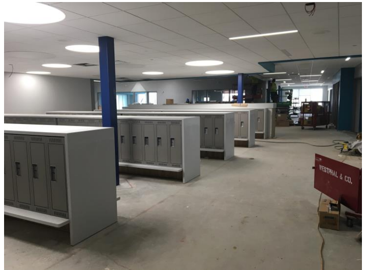
In the 2 nd /3 rd grade classroom, almost all of the finishes are complete! Lights and lockers are installed, ceiling tile is dropped, and drinking fountains are in. The only remaining component is carpet, which will be starting next week!