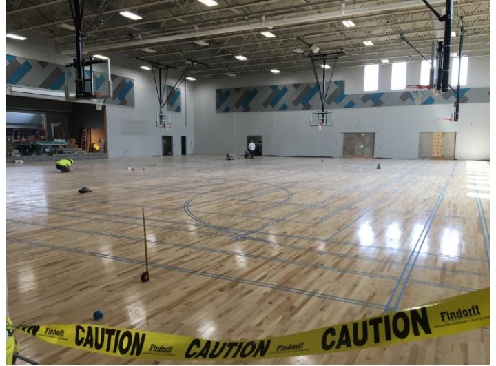
The gym floor installation is in progress and almost complete! The top layer has been sealed, and now the game lines are being painted!