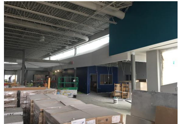
On the 2 nd floor, the library and art room are being painted. After this, the painters will begin applying final coats to all of the walls in the school!