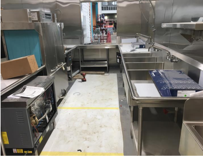
In the kitchen, the stainless steel dishwasher and sinks are installed and ready to clean those dirty dishes!