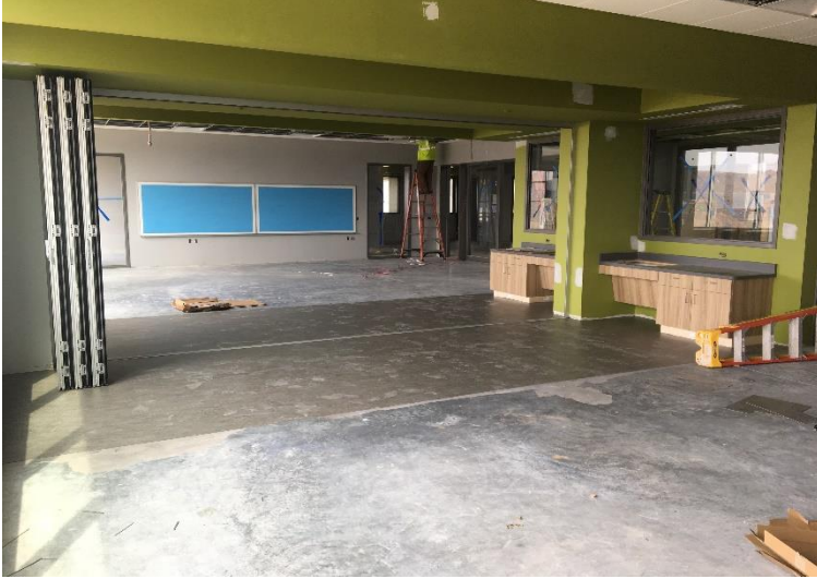
Here is a look into one of the first grade classrooms! This gives a glimpse of the casework, resilient floor, markerboards, and divider wall, and overall it shows what a finished classroom will look like. The only pieces missing are the carpet and furniture!