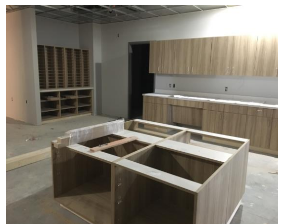
In the administrative offices, the carpenters have been installing casework!