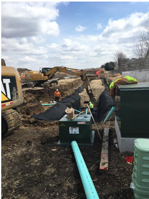
Sitework is starting at the school! Here, gravel is being poured for the thermal rock garden. Site grading, curb and gutter installation, and more exterior sitework will continue in the coming weeks!