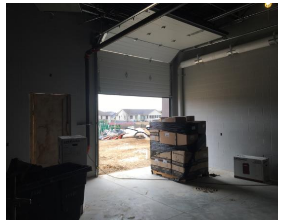
The overhead garage doors in the back of house are up and running, making deliveries easy to unload.