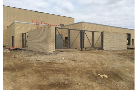
The brick for the exterior trash enclosure near complete. All of the school's brick is now installed!