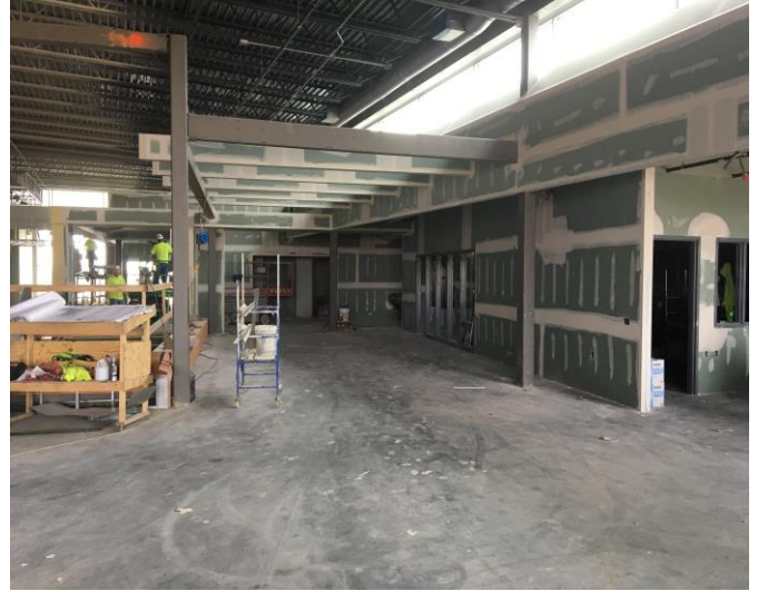
The drywallers finished up the art room and library area last week, and now it is getting taped and prepped for paint.