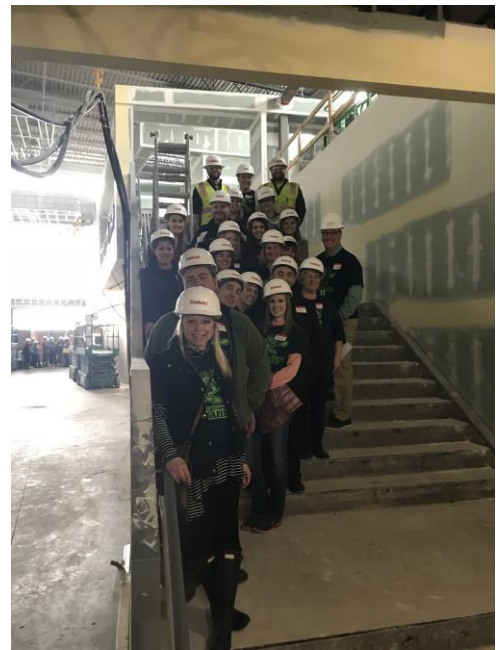
On Wednesday, the future Token Springs teachers took a tour of the school! Everyone was very impressed with the progress and excited to move in!