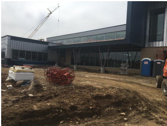
The exterior canopies are drywalled and have been sprayed with the air-vapor barrier, so they are now ready to receive metal panels!