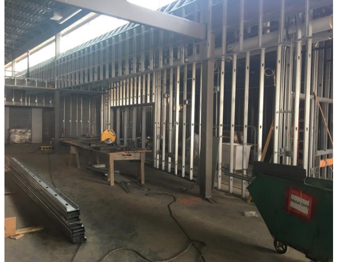
The drywallers will be busy next week because the library and art room walls are completely framed and ready to be drywalled!