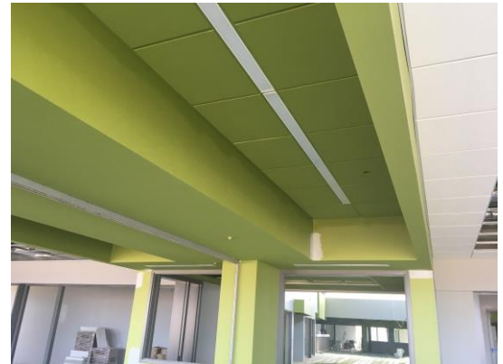
Ceiling grid is being dropped in the kindergarten/1 st grade wing, adding some nice color to the classrooms!