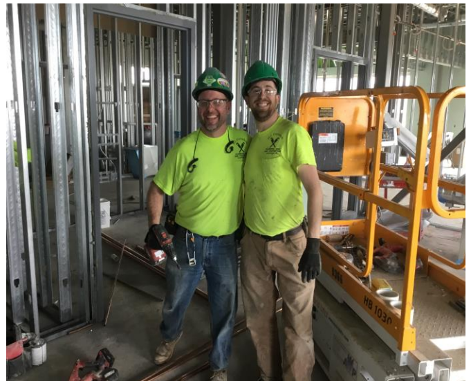
Our plumbers are all smiles as they see the progress that Token Springs Elementary is making!!