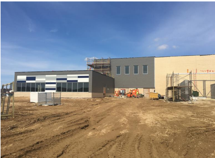
On the outside of the gym walls, the metal panels are installed and looking sleek! Now that the gym is finished, there are only a few spots left on the school that need metal paneling!