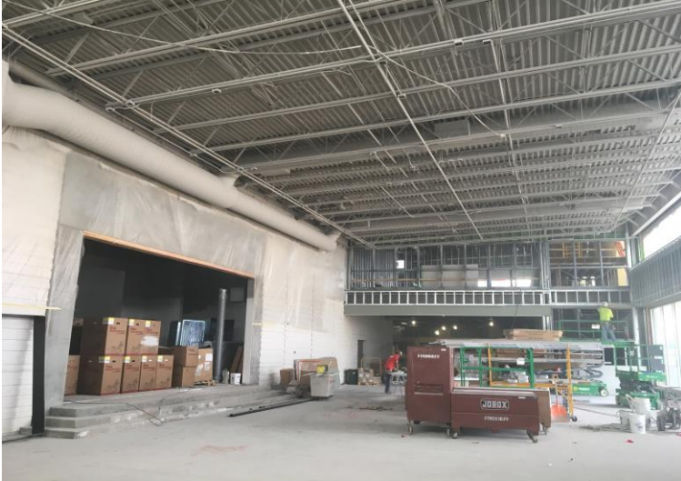
The cafeteria ceiling was painted this week and drywall will be installed on the soffits next week.