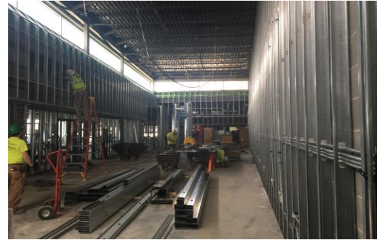
MEP rough-ins are progressing nicely in the ELRC as the area gets ready for drywall soon.