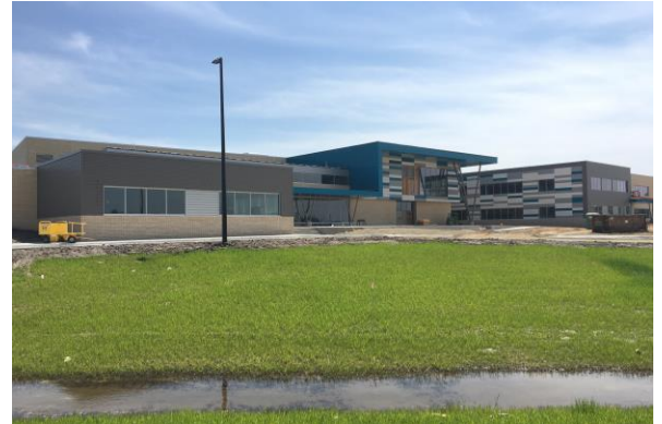
The grass is growing, the light poles are installed, and the school is very close to completion!