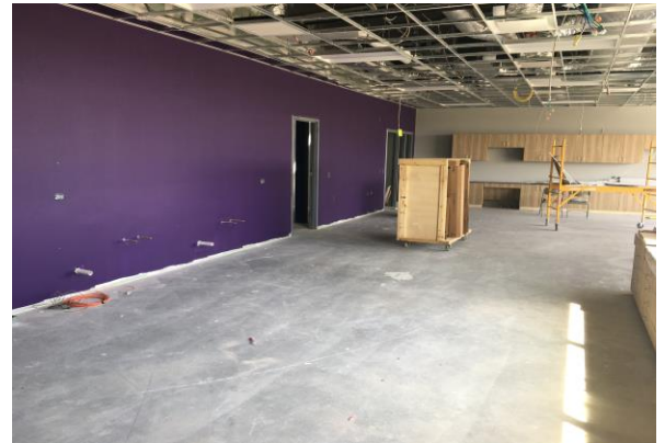
Casework is now installed in the art room, and the walls are painted as well. The kiln is arriving soon and then the art room will be complete!