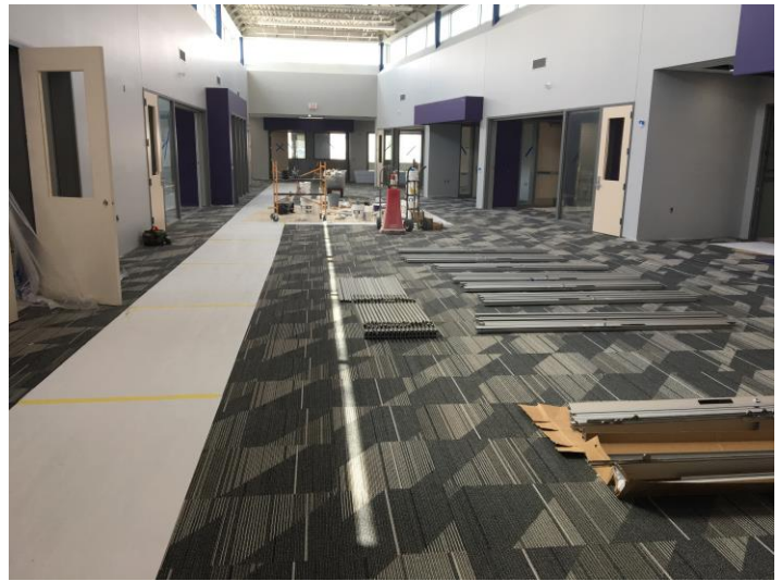
Carpet is laid in the kindergarten/1 st grade and the 2 nd /3 rd grade classroom wings. This photo shows the hallway in the kindergarten/1 st grade wing!