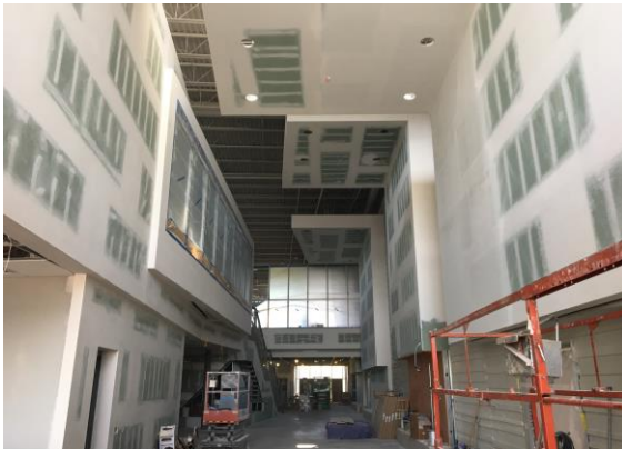
The overhanging cloud soffits at the main entrance are being taped and prepped for paint.