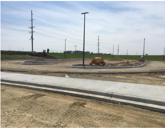
Site work is making great progress! This week, curb, gutter, and sidewalks were installed, along with light poles.