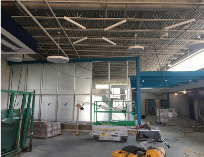
On the 2 nd floor, windows and lights are being installed. The lights are arranged in various patterns, and are different shapes and sizes, creating an aura of natural light.