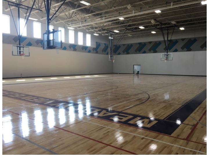
The gym floor is painted! All that remains in the gym is the scoreboard and bleacher installation!